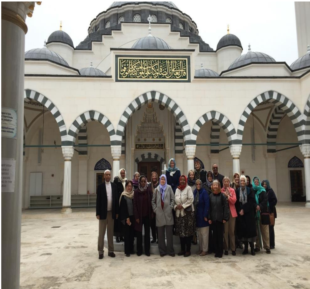
AAUW Howard County members and friends in courtyard of the Mosque.

All funds raised at the Festival will go towards the Scholarship Fund.