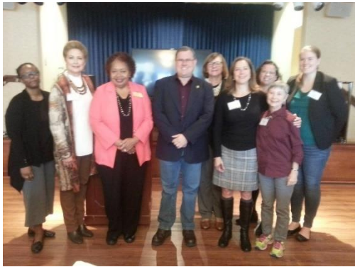
AAUW Maryland members with Gaithersburg Mayor Jud Ashman and Council Member Yvette Monroe