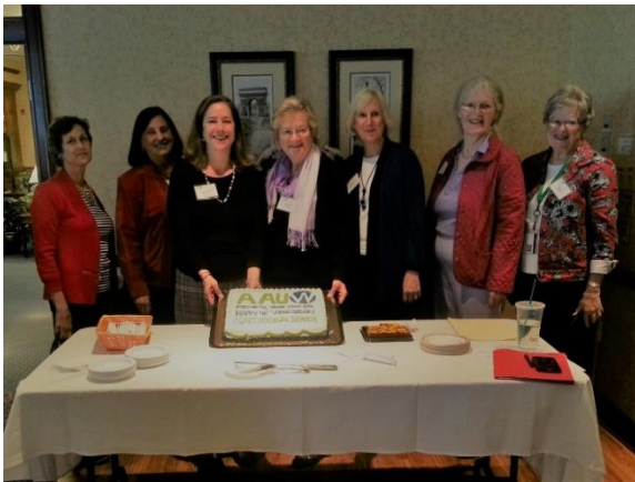
Gaithersburg Branch members celebrating their 45 th anniversary