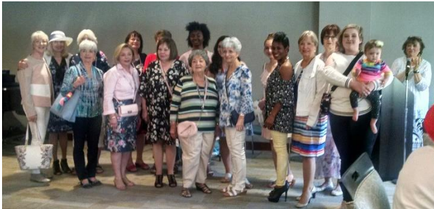
Models at the 2018 Howard County Fashion Show