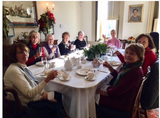
Easton Branch Members Enjoying Tea

On Saturday, December 8, 15 members of the Easton Branch enjoyed a lavish High Tea in Chestertown, served in the sumptuous rooms of the historic Hynson Ringgold House, the riverfront home where George Washington actually slept and dined. Built circa 1743 for a wealthy merchant, the mansion is now the official residence of the president of Washington College.