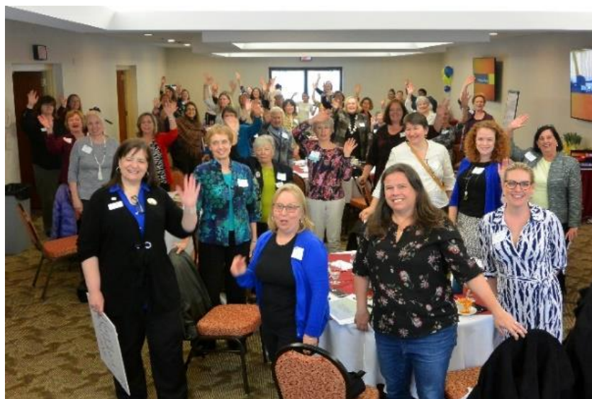
State Convention Attendees

https://www.aauw.org/resource/2019-state-convention-presentation/ .