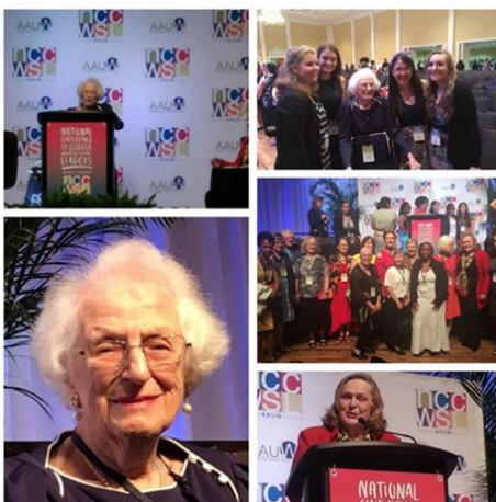
Photos from the 2016 Women of Distinction Ceremony when Nancy Grace Roman was honored as Maryland Woman of Distinction.

AAUW has received the largest bequest in its history from the estate of Dr. Nancy Grace Roman, AAUW Maryland Woman of Distinction in 2016. Dr. Roman was a member of the Bethesda-Chevy Chase Branch, an astronomer, the first woman executive at NASA, and the "Mother" of the Hubble Space Telescope. She directed that the funds be used for STEM related activities. The AAUW staff is researching how best to use this generous bequest.