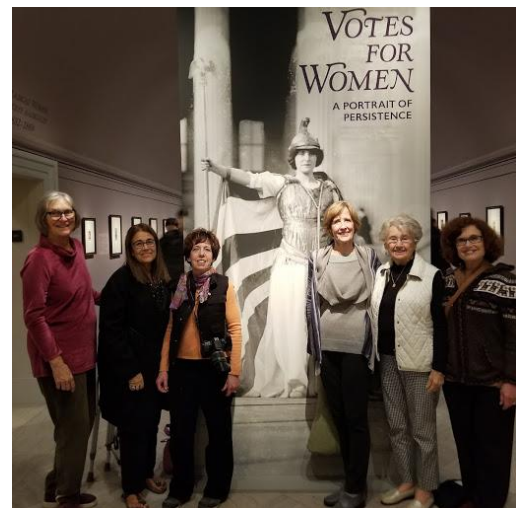
AAUW members Visiting the National Portrait Gallery

On November 14 members visited the National Portrait Gallery in D.C. which is highlighting famous women in the history of the suffrage movement.