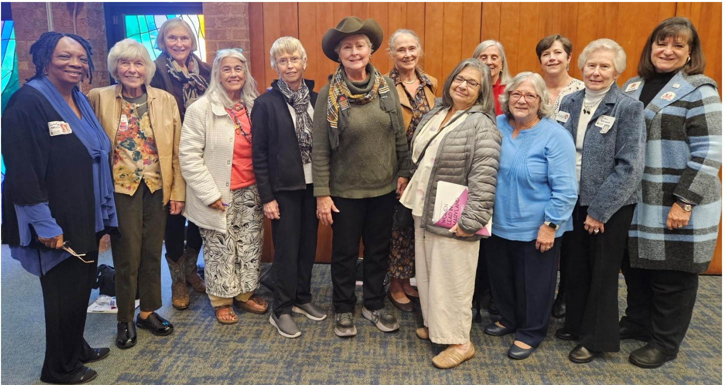
AAUW Maryland members at the Fall MLAW conference on November 1.

In addition to our state advocacy efforts, please continue to respond to the Action Alerts from National. One alert came in today for another Civil Rights problem, this time at the Department of Justice. And I will mention again that all members are strongly encouraged to join the Capitol Hill Lobby Corp.